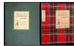
Original box and wool cover

The cover of the book also has a paper label attached to the front and spine. This book was originally published with a green cardboard box, also with a paper label attached. The box was also very fragile and is almost never seen. The book was also issued in a standard trade edition in 1926 with a traditional dust jacket and no cloth on the binding.