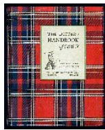
Tartan cloth wool cover

The Duffer's Handbook of Golf by Grantland Rice and Clare Briggs was issued in a signed limited edition of 500 hand-numbered copies in 1926. The red plaid wool cover has generally not stood the test of time. The cover is often in poor condition due to moth or insect damage or it is torn due to its delicate nature.