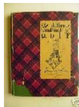
Standard trade edition with jacket

The cover of the book also has a paper label attached to the front and spine. This book was originally published with a green cardboard box, also with a paper label attached. The box was also very fragile and is almost never seen. The book was also issued in a standard trade edition in 1926 with a traditional dust jacket and no cloth on the binding.